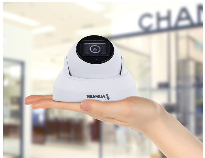
Easy Installation and Compact Size